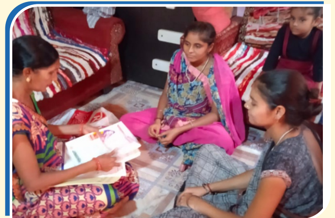
Counselling Service at Village Level