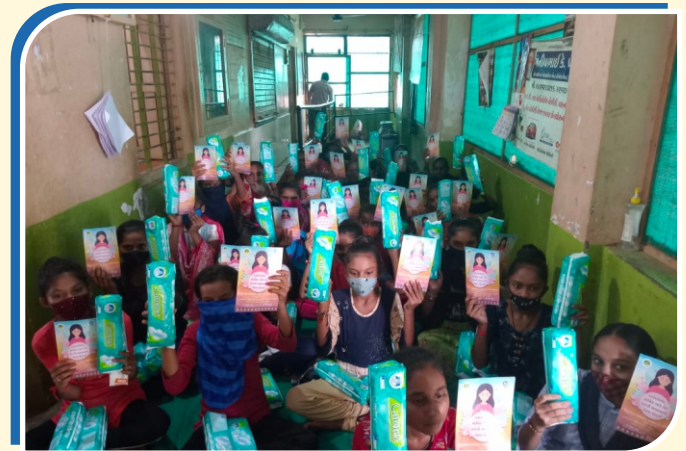
Project Taruni Menstrual Health & Hygiene