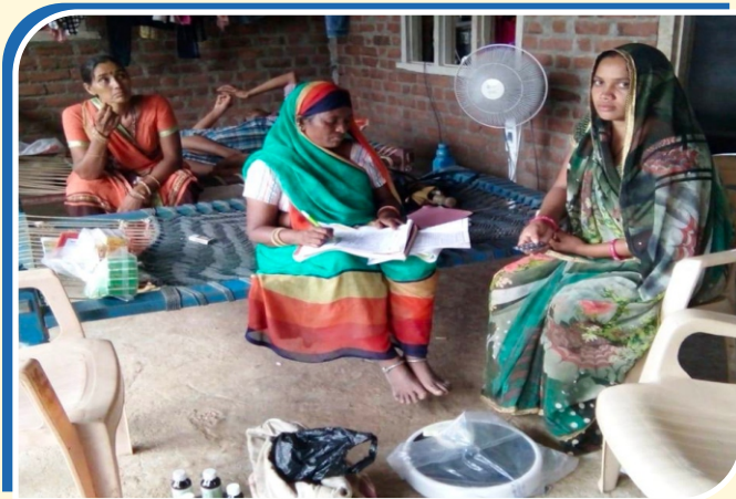
Door Step Mother & Child Care