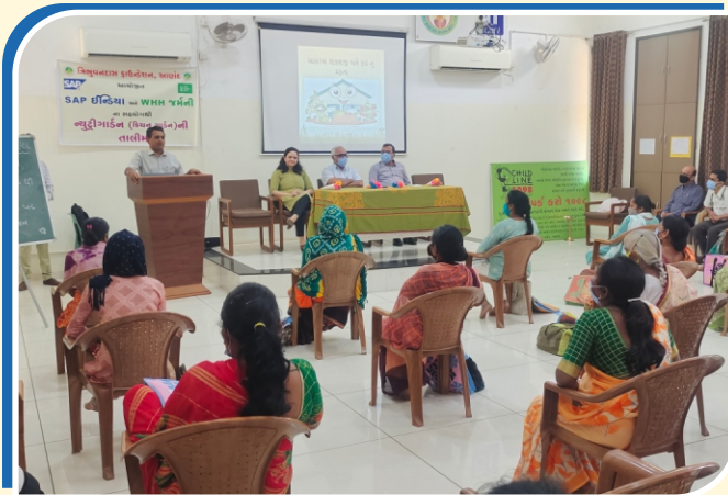
"Samvardhan" Training on Organic Farming