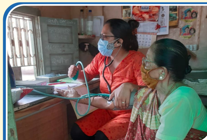
Primary Health Care at Anand Centre