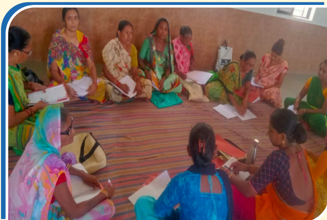
Health Workers Training