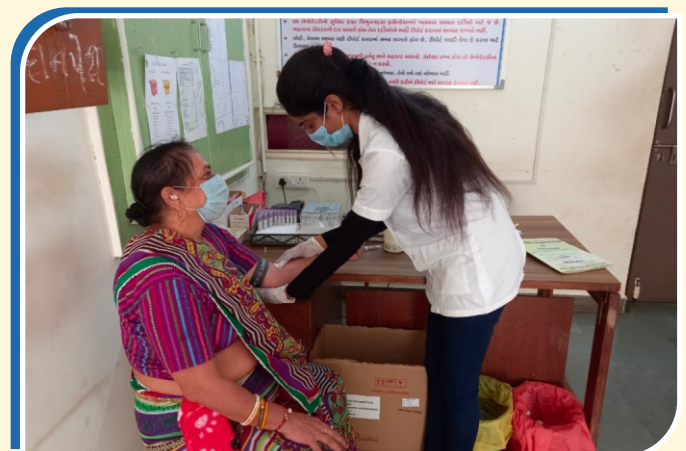
Lab Test Service at Anand Centre