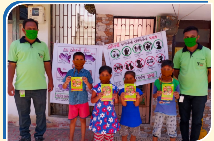
Awareness by CHILDLINE 1098