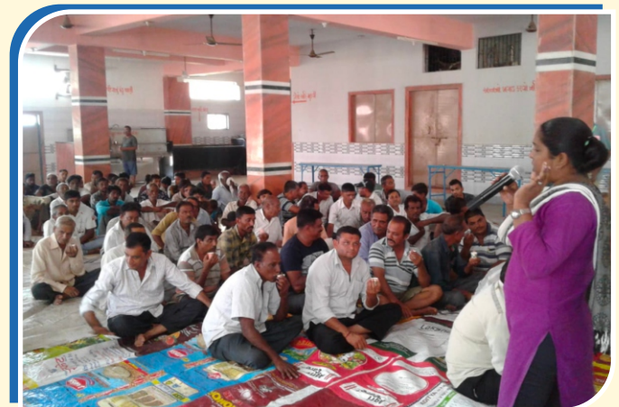
Awareness Programme at Milk Dairy Co-Operative Society