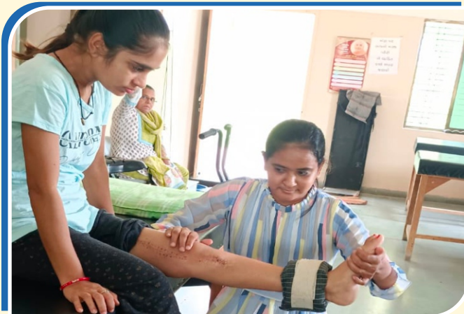
Physiotherapy Service at Kheda Centre