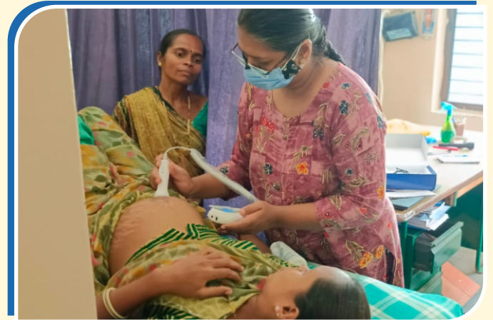
Antenatal USG Services