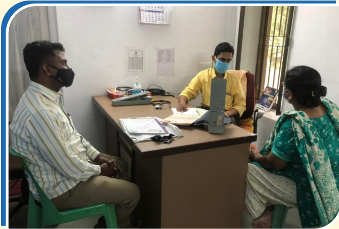
Clinical Service for rural People