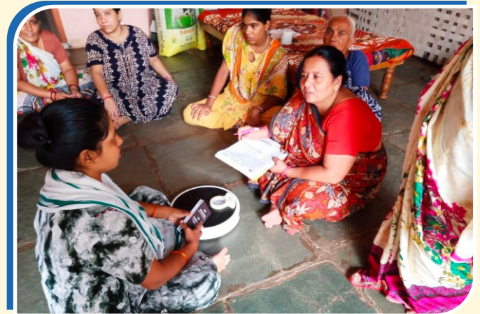
Jatan Comprehensive Mother & Child Care