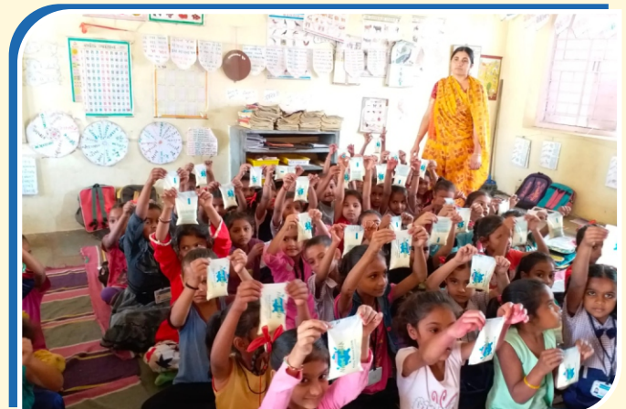
Nutrimilk Activity Against Malnutrition