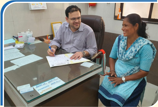
Gynec OPD Service at Kapadvanj Centre