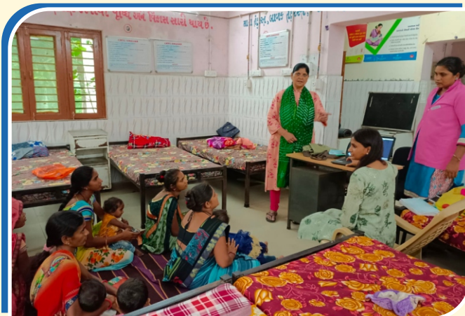
Training of Health Workers