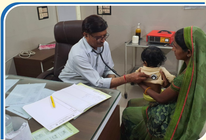
Pediatric OPD at Kapadvanj Centre